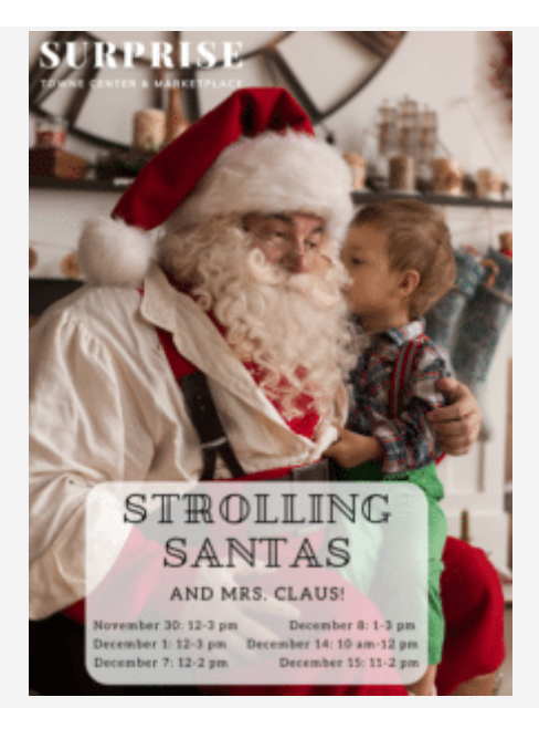
Strolling Santa at Surprise Town Center

Surprise Towne Center & Marketplace Bell Rd. and Grand Ave., Surprise surprisetcmp.com