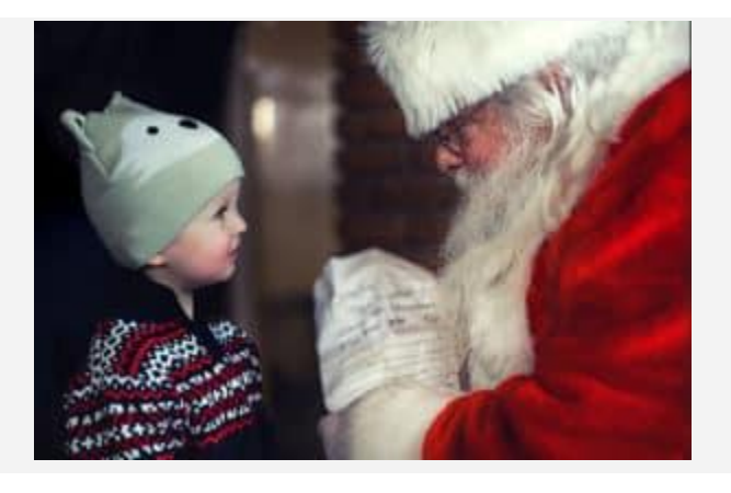
Breakfast with Santa at HD South in Gilbert

Dec 7: Stop by this beloved holiday tradition and annual fundraiser for HD SOUTH. Anticipating nearly 150 attendees, the event features a private tour of a model train display, holiday-themed activities, hot cocoa, cookies, and a visit with Santa for photos. More than just an event, Santa Express celebrates community, joy, and the spirit of giving during the festive season. 5:30-8pm. $15 per person, ages 2 and under are free.