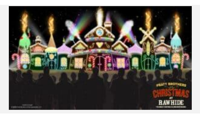
Pratt Brothers Christmas at Rawhide

Rawhide Western Town 5700 W North Loop Rd., Chandler PrattBrotherschristmas.com