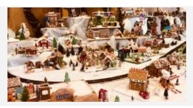
Prescott's Gingerbread Village

Nov 30 to Jan 1: The Prescott Resort & Conference Center invites you to join us for the 32nd Annual Gingerbread Village. Get in the holiday spirit this year and make plans now with your co-workers, family and friends and build a cottage, a bungalow or estate!