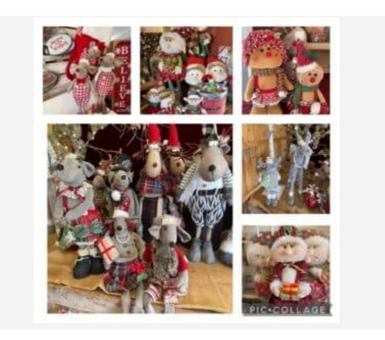
Holiday Shop at Mother Nature's Farm

Dec 1 to 24: The farm will have fresh cut Douglas Firs and Noble Firs for sale. Bring the family for the hunt for the perfect tree for your holidays!