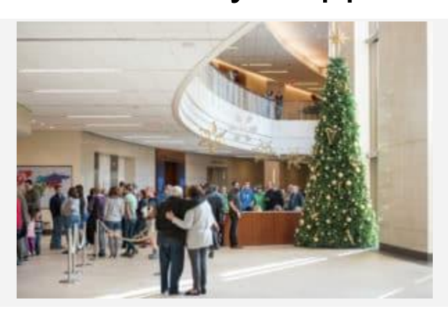
Holidays at Musical Instrument Museum

Dec 14 and 15: Get in the holiday spirit at this merry event as MIM transforms into a musical "Winter Wonderland" with seasonal songs and musical traditions from around the world. 9am to 5pm. Included with paid admission to the museum, free for members. Daily schedule of events/performance times can be viewed here: