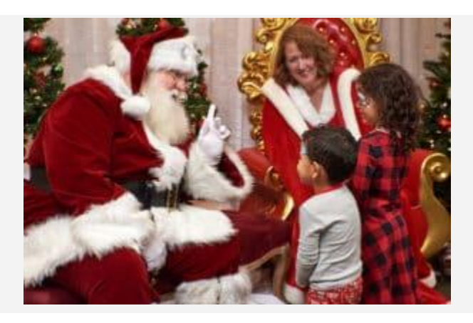
Santa and Mrs Claus at Winterfest

Avondale Civic Center Complex, 11465 W. Civic Center Dr., Avondale avondaleaz.gov