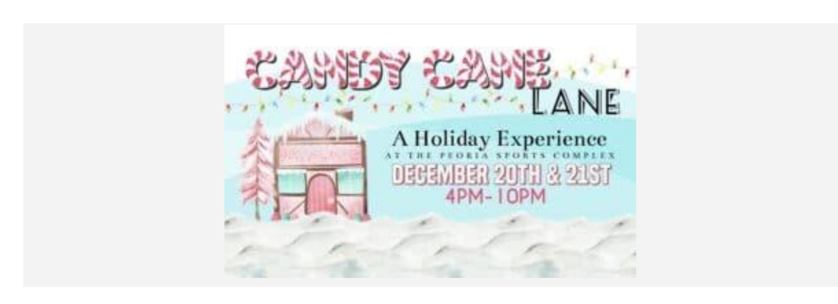
2024 Candy Cane Lane at Peoria Sports Complex

peoriasportscomplex.com/community-events