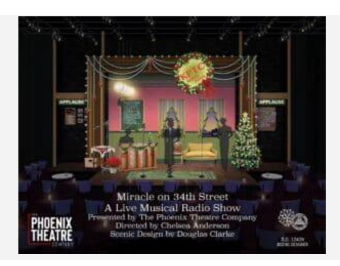
Miracle on 34th Presented by Phoenix Theatre Company

phoenixtheatre.com/miracle-34th-street-live-musical-radio-show