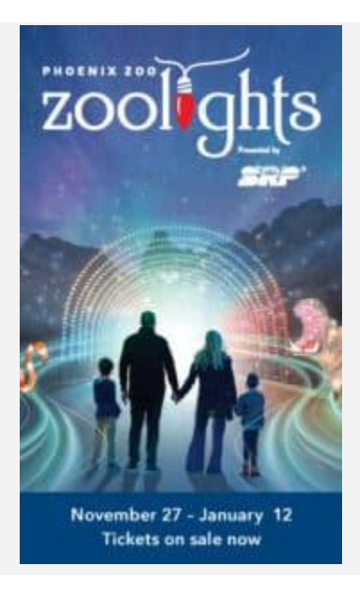
2024 ZooLights at Phx Zoo

455 N. Galvin Pkwy., Phoenix. phoenixzoo.org/zoolights