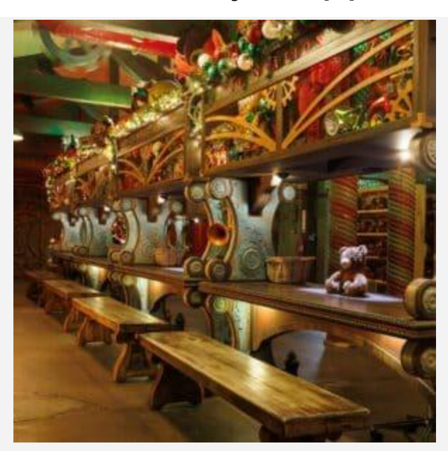
The North Pole Experience in Flagstaff

Nov 15 to Dec 24: Experience the magic of the holidays at Santa's 400-year-old workshop. Explore the toy factory, Mrs. Claus's bakery, Elf University, Santa's Sleigh Hanger, and enjoy special moments with St. Nick himself, including family photos. Santa's incredible workshop is a must-see, so sneak a preview before you arrive (the elves won't spill the secrets!). Dates and times vary, for more details see the website.