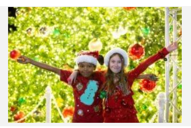
Merry Main Street in Downtown Mesa

Nov 29: Join Downtown Mesa for the lighting of the Christmas Tree and official kick-off of Merry Main Street holiday celebration! Tree Lighting program, visits with Santa, opening of the Winter Wonderland Ice Rink, Jack Frost's food truck forest, live music and more! Event runs from 5 to 10pm. Mesa Christmas Tree is located at 1 N. Macdonald, Mesa