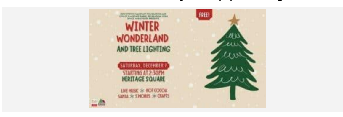
2024 Winter Wonderland and Tree Lighting

Dec 7: Kick off your holiday season in Downtown Flagstaff – home of Arizona's Winter Wonderland! Beginning at 2pm there will be hot cocoa, smores and crafts to keep you nice and warm while listening to live performances. The spectacular tree lighting takes place at 6:15pm. Admission is free. 2:30 to 7pm. See website for more information.