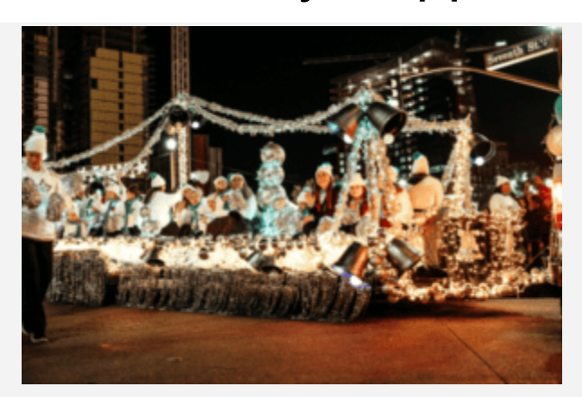
Tempe Fantasy of Lights Parade