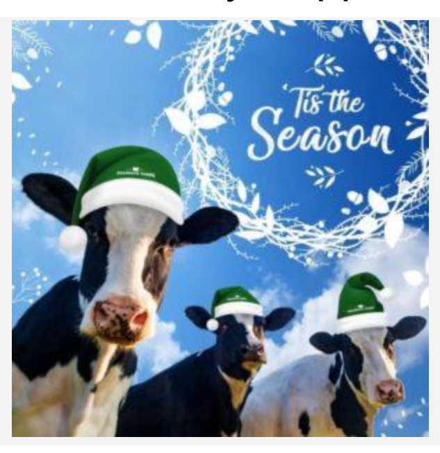
Joy to the Heard at Shamrock Farms

Dec 7 & 8: A unique holiday event that combines a glimpse into a working dairy farm with festive and fun activities, Shamrock Farms transforms its large Welcome Center Barn into a winter wonderland with holiday crafts, face painting and more! Of course, no holiday celebration would be complete without a special visit from Santa and Shamrock Farms' own jolly spokescow – Roxie! The holiday cheer continues with festive décor added to the cow-spotted tram as visitors take our fun and educational guided Farm Tour where they can get up close and personal with 10,000 cows and learn about how our pure and fresh milk gets from the farm to table! Other tour highlights include a visit to our milking barn that accommodates 1,600 cows (milking 200 at a time) plus a visit to our interactive play zone.