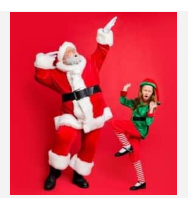
Santa and Mrs. Claus Day at Kidstop Toys & Books

3030 E Thunderbird Rd, Phoenix hopephx.com/events