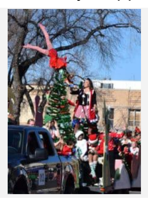
Prescott Annual Christmas Parade

Dec 7: Celebrate this season with a festive parade around downtown Prescott, featuring floats, festivities, and Mr. & Mrs. Claus! Over 100 entries for the whole family to enjoy! A few hours later we gather in the Courthouse Square with eager anticipation as we wait for the Christmas lights to come to life! We take pride in our annual celebration and hope you will be a part of it! Parade begins at 1pm in Downtown Prescott. The Annual Courthouse Lighting Event will be held following parade at 6pm and fireworks will conclude the night. Visit website for event maps and more information.