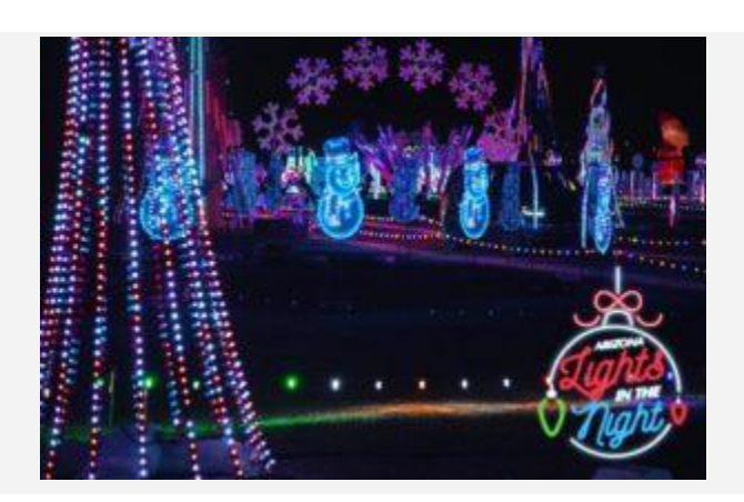
Arizona Lights in the Night

Nov 27 to Dec 28: Get ready for a magical evening at this drive-through holiday experience, featuring over one million synchronized lights and festive music, creating a breathtaking atmosphere for all ages. This family-friendly, one-mile event showcases dazzling displays, including glowing reindeer, oversized snowmen, and candy canes, all choreographed to both classic and modern holiday tunes.