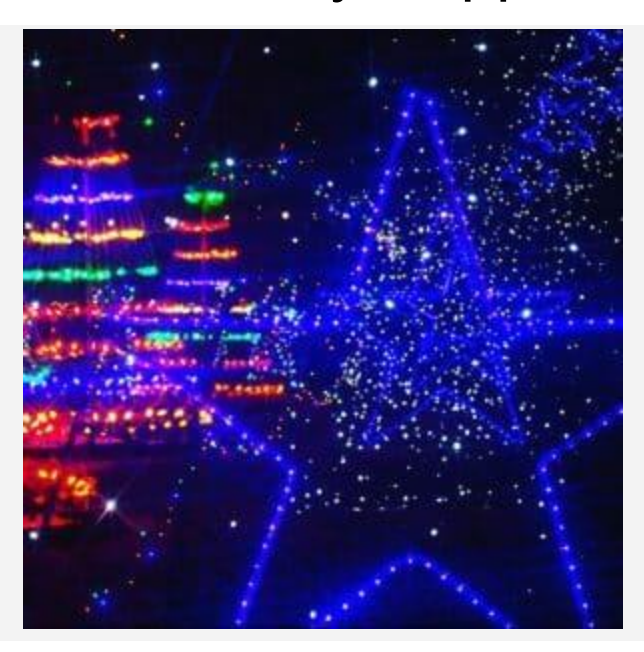
Valor Christmas Light Show

Nov 27 to Dec 28 (Closed Sundays): Experience Arizona's largest and most spectacular holiday light show, featuring over 2 million LED lights at Valor Christian Center. Formerly known as Lights at the Farm , this event has grown into a must-see holiday tradition for families across the Valley. Stroll through stunning light displays, all synchronized to your favorite Christmas songs, and enjoy an even bigger and more exciting venue, now spread across 2.5 acres. Perfect for families and friends, Valor Christmas is an unforgettable way to kick off the holiday season.