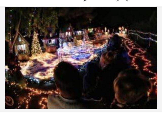
Holiday Lights at the Railroad Park

Nov 29 to Dec 30 (Closed Dec 5, 24,25) : Hop on board the Paradise & Pacific Railroad and experience a winter wonderland of holiday lights and displays. No trip to the park is complete without a spin on the historic Charros Carousel or a cup of hot cocoa from Hartley's General Store. Admission is $15, children 2 and under are free. 6-9:30pm. Tickets can only be purchased online via Active Net beginning Nov. 1.