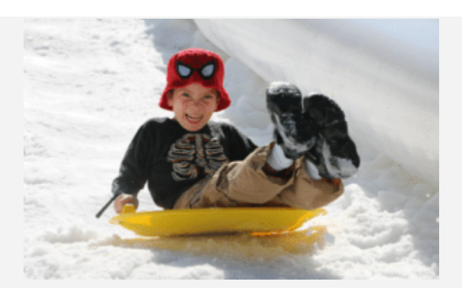
SnowFest at Salt River Fields

Salt River Fields 7555 N. Pima Rd. Scottsdale holidaysnowfest.com