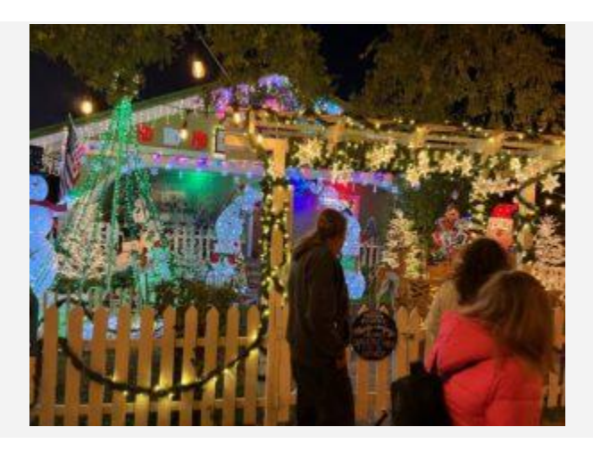
Downtown Glendale for Glendale Glitters

Downtown Glendale/Glendale Civic Center 5750 W. Glenn Dr., Glendale glendaleaz.com