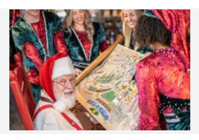
Pioneer Winter Wonderland

3901 W. Pioneer Road., Phoenix pioneerwinterwonderland.com