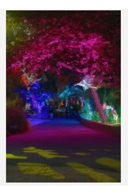
One Night Only – Sensory ZooLights

Dec 2: One night only! Join ZooLights for an experience designed for guests that thrive in a sensory-supportive environment.