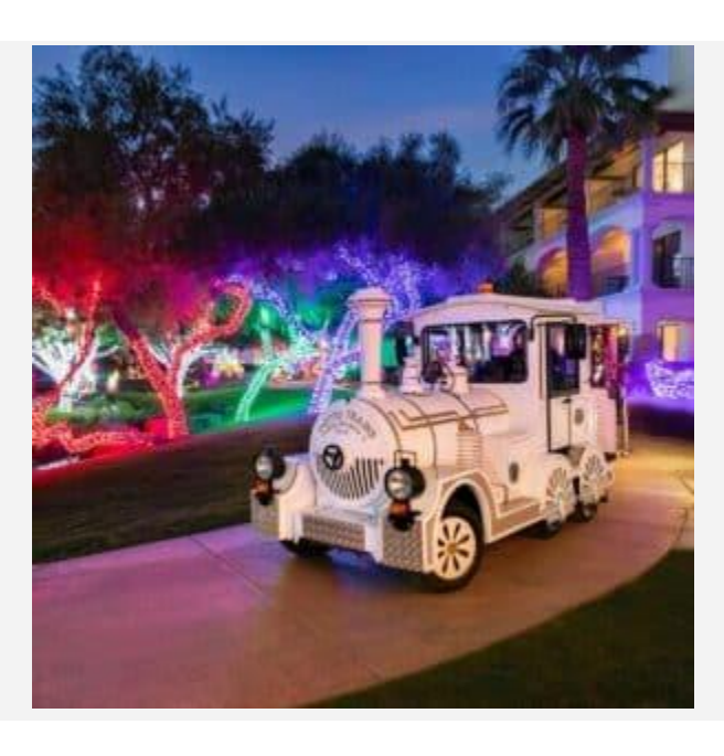
Christmas at The Scottsdale Princess

7575 E. Princess Dr., Scottsdale christmasattheprincess.com