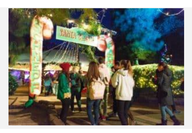
Christmas at Schnepf Farms

Nov 29 to Dec 1, Dec 5 to 8, Dec 12 to 24: Experience a winter wonderland like no other with seasonal food, fun and festivities for the whole family. Catch a ride on the World of Illumination Express, hop on a hayride to visit Rudolph, skate on ice, or journey through Santa's magic workshop. There will also be a Christmas carousel, cookie decorating with Mrs. Claus, snow globe mini golf, a beer and wine garden for the elves over 21 years of age, bonfires s'mores, and the world's largest inflatable Christmas-themed obstacle course.