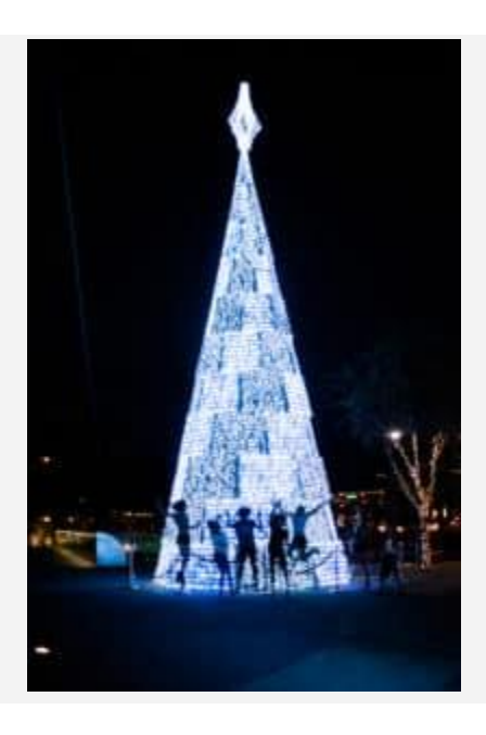
City of Scottsdale's Scottsdazzle