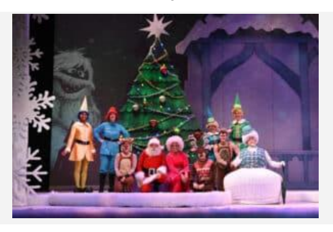
Rudolph the Red Nosed Reindeer

Nov 16 to Dec 23: Follow the delightful journey of Rudolph and his friends as they encounter the Abominable Snowman and journey to the land of Misfit Toys. With projection magic and incredible costumes, the iconic stop-motion sensation truly jumps from the TV to the stage! Filled with holiday hits like "Rudolph the Red-Nosed Reindeer" and "Holly Jolly Christmas," Sam the Snowman floats across the stage and tells the story of Rudolph's journey. The North Pole will come to life, complete with Santa Claus and his hilarious elves! Childsplay Theatre will bring magic to your holiday celebrations as Rudolph soars in the air, teaching us that what makes us different can also make us special. There will also be free family activities at each show – visit the Elves Workshop to construct a craft, enjoy a cup of Mrs. Claus' hot chocolate, and every child gets a free red nose! Tickets start at $15. Visit website to view show times and purchase tickets.